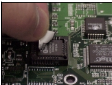
Figure 3.0 - Peeling back the sticker

Please be aware that by flashing your BIOS, you agree that in the event of a BIOS flash failure, you must contact your dealer for a replacement BIOS. There are no exceptions. Tyan does not have a policy of replacing BIOS chips directly with end users. In no event will Tyan be held responsible for damage done to the BIOS by the end user.