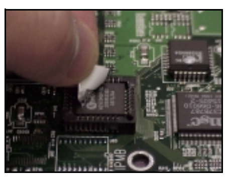
Figure 3.0* - Peeling back the sticker

Please be aware that by flashing your BIOS, you agree that in the event of a BIOS flash failure, you must contact your dealer for a replacement BIOS. There are no exceptions. Tyan does not have a policy of replacing BIOS chips directly with end users. In no event will Tyan be held responsible for damage done to the BIOS by the end user.