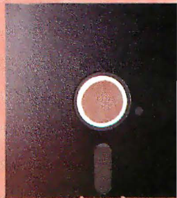
Uses industry-standard 5 1/4" diskettes